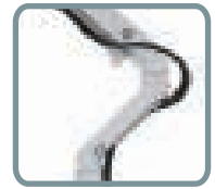
CABLES ROUTE BENEATH THE ARM, OUT OF THE WAY