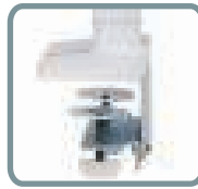
INCLUDED: STANDARD 2-PIECE DESK CLAMP ATTACHES TO SURFACE EDGE