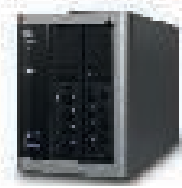
MY BOOK™ PRO