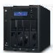
MY CLOUD™ PRO PR4100