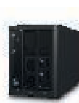
MY CLOUD™ PRO PR2100