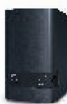
MY CLOUD™ EX2 ULTRA