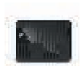
MY PASSPORT™ X