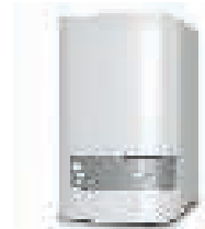
MY CLOUD™ MIRROR