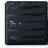
MY PASSPORT™ WIRELESS PRO