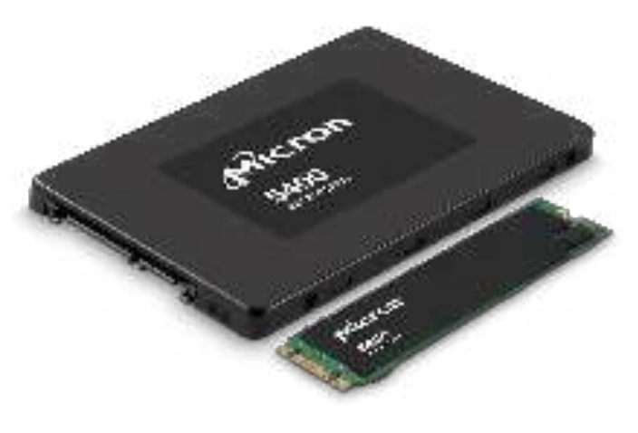
Micron 5400 SSD

Additional firmware-based security options like TCG Enterprise and TCG Opal combine with integrated, hardware-based AES 256-bit encryption for full performance plus extra security and peace of mind.<sup>5</sup>