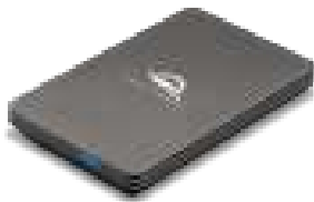
OWC Envoy Pro FX