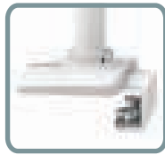
WHITE UNDER MOUNT C-CLAMP ACCESSORY 98-082: ATTACHES TO SURFACE EDGE