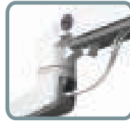
CABLES ROUTE BENEATH THE ARM, OUT OF THE WAY