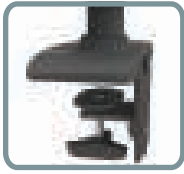
INCLUDED: STANDARD 2-PIECE DESK CLAMP ATTACHES TO SURFACE EDGE