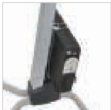
UNIVERSAL CPU HOLDER 80-105-064 (DARK GREY)