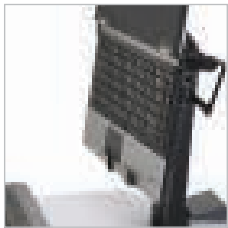
NF CART LAPTOP VERTICAL KIT 97-546