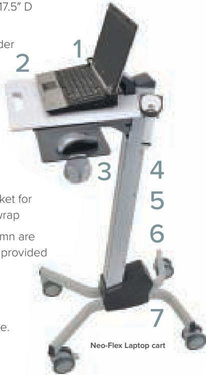
Neo-Flex Laptop cart