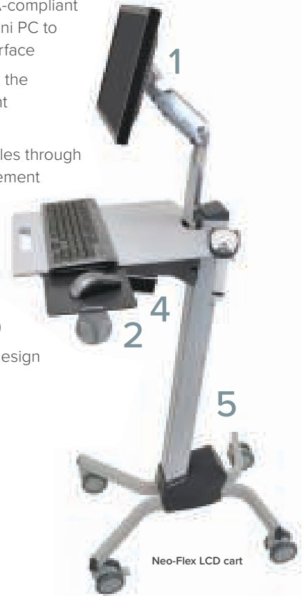
Neo-Flex LCD cart