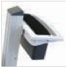
NF CART HANDLE AND BASKET KIT 97-545 (GREY)