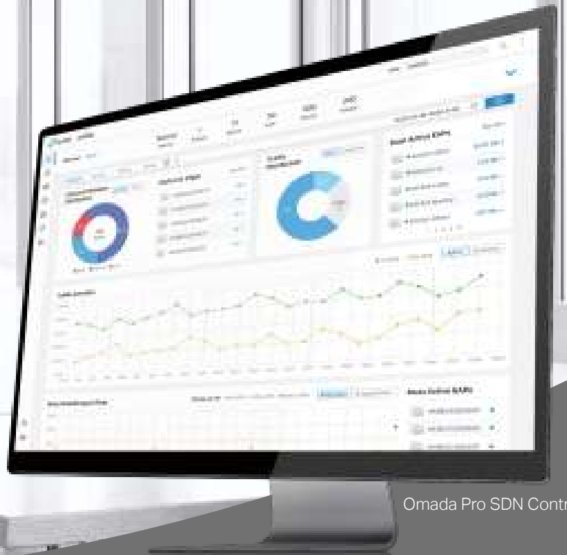
Omada Pro SDN Controller