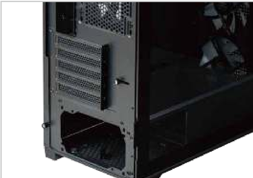
5 Reusable Expansion Slots