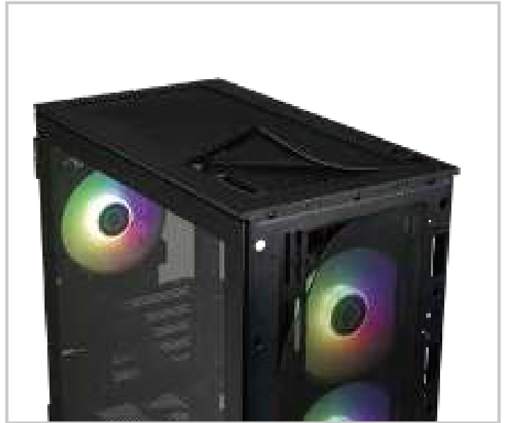
Magnetic Dust Filter on Both Top and Front Side