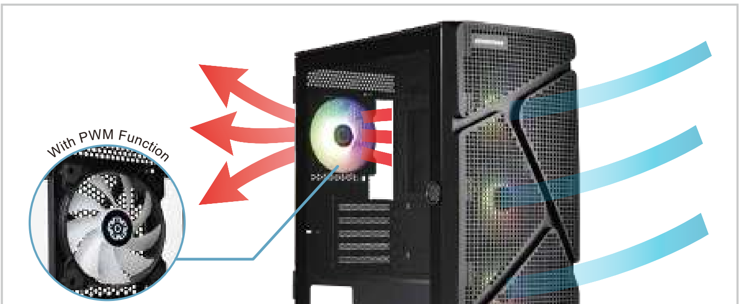
Pre-installed 4 ARGB PWM Fans