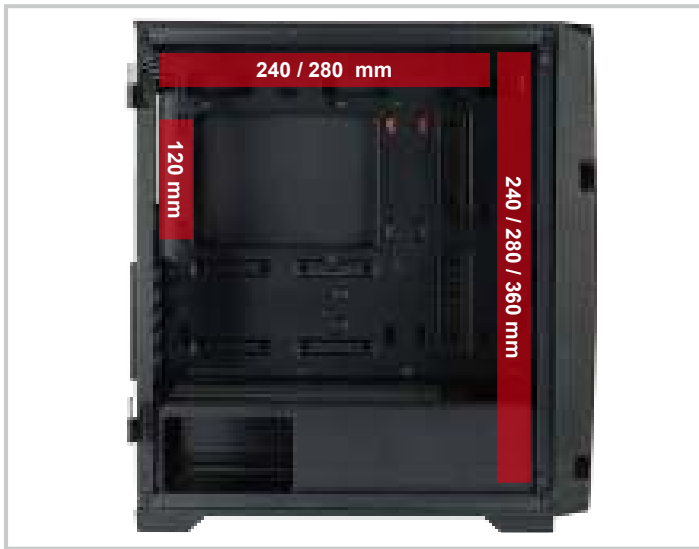
Support 360 AIO in 38mm Thickness