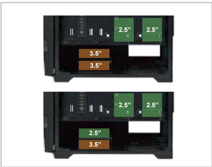
Support 2 x 3.5" and 3 x 2.5" (1 x Converted From 3.5" HDD Cage Drive Bay)