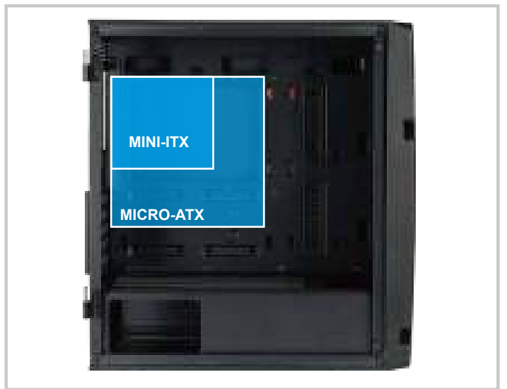
Mini ITX to Micro ATX Motherboard Compatibility