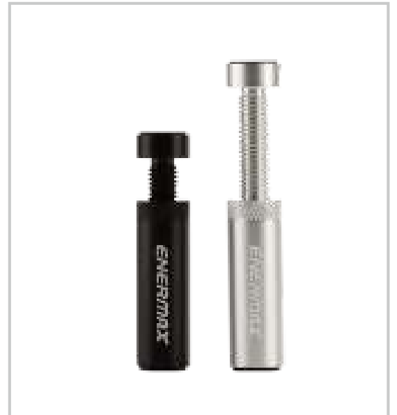
Comes with GPU Holder