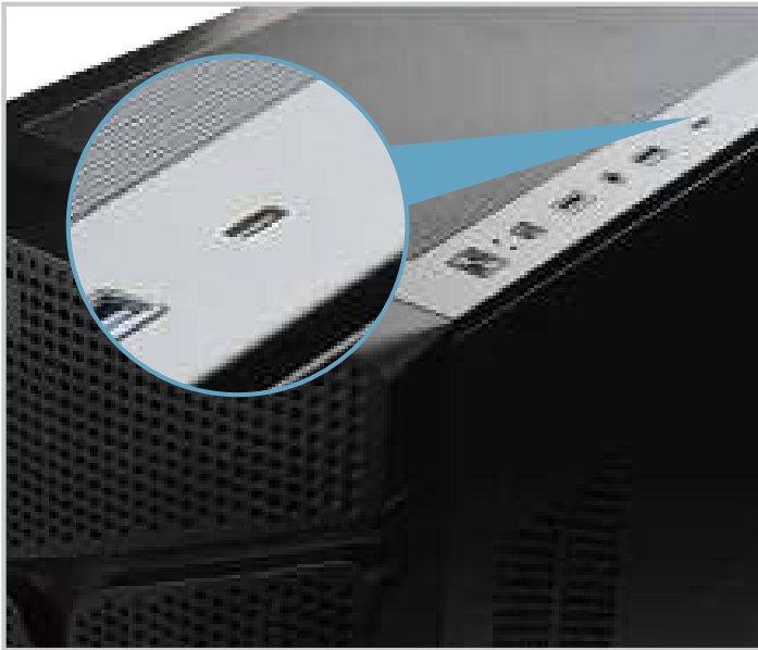
Build-in USB 3.2 Type C + USB 3.0 x 2