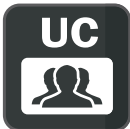
Compatible with mainstream UC platforms