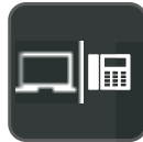
Multiple Devices Connection