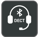
DECT & Bluetooth Hybrid Wireless Technology

The WH64 is a wireless headset for business communication. It integrates DECT and Bluetooth modes, offering efficiency and flexibility. Its advanced acoustic shield technology 2.0 filter out background noise for clear sound transmission. The busylight signals your call status to avoid interruptions. Ergonomically designed for an all-day comfortable wearing experience. With high-quality materials and a lightweight build, it provides a solid experience. It connects seamlessly with IP phones and UC platforms for plug-and-play and device switching. Ideal for clear conversations and smooth office experiences.