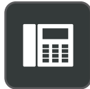
Plug & Play for Mainstream IP Phones