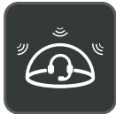
Acoustic Shield Technology 2.0