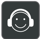
All-day- wearing Comfort