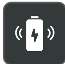
Up to 32 hours Talking Time