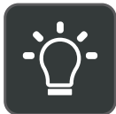
Hybrid Visual Busylight