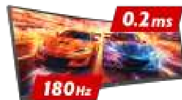
180Hz & 0.2ms MPRT

The Fast IPS panel technology guarantees not only high-fidelity, vivid battleground scenes displayed with outstanding colour accuracy but provides also an outstanding 0.2ms Moving Picture Response Time (MPRT).