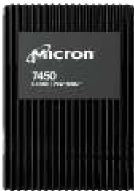
U.3: 7mm and 15mm

Designed as a mainstream solution, the 7450 SSD balances performance and density. Our offering includes a PCIe Gen4, M.2, 22 x 80mm with power-loss protection 4 and a 7.68TB E1.S that delivers industry-leading capacity. 5