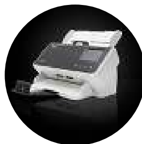
Alaris S2060w/S2080w Scanners