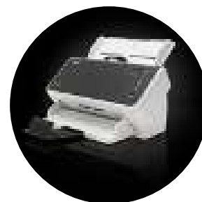
Alaris S2050/S2070 Scanners